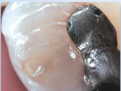
State of the seal of the amalgam