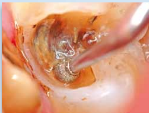
Dental cavity preparation