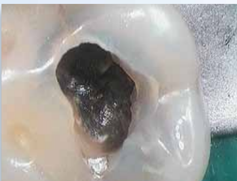
Infiltration of the metallic ions