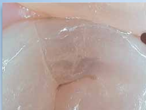
Micro fissure with lesion

In dentistry, many daily procedures require magnification glasses or a microscope together with a mirror to observe the areas requiring treatment. The Sopro 717 First allows you to go beyond the limits of human vision while casting off bulky accessories. This is MacroVision.